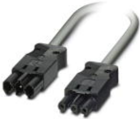
Power cable, 3-position, PVC, gray RAL 7001, Plug straight, black, on Socket straight, black, Cable length: 0.6 m

Please be informed that the data shown in this PDF Document is generated from our Online Catalog. Please find the complete data in the user's documentation. Our General Terms of Use for Downloads are valid ( http://phoenixcontact.com/download )